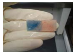
Figure 1 (left). Section of pig skin partially treated with NIMBUDERM™ (left half) after rinsing followed by saturation with Bromothymol blue dye solution. Blue area represents coverage of the treatment due to the electrostatic interactions between the dye and NIMBUDERM™.

Test method used was modified AOAC Use-Dilution Test on 'glass slide and/or' pig skin carriers at a 4 hour exposure - drying time for sanitizer ranged from 1 hour to 3 hours