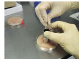
Figure 4 (above). Scrubbing of pig skin treated with NIMBUDERM™.

*indicates full kill ** Rinsing step includes 20X applications (~1 ml each) to sanitizer applied area from standard spray bottle.