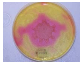
Figure 2 (above). Mannitol Salt Agar (MSA) plate inoculated with S. aureus after NIMBUDERM™ application. MSA appears yellow where S. aureus metabolizes the mannitol. Pink area represents NIMBUDERM™ applied area in which there are no organisms present.