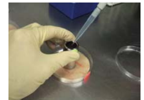
Figure 5 (above). Recovery of organisms after the scrubbing process prior to enumeration.